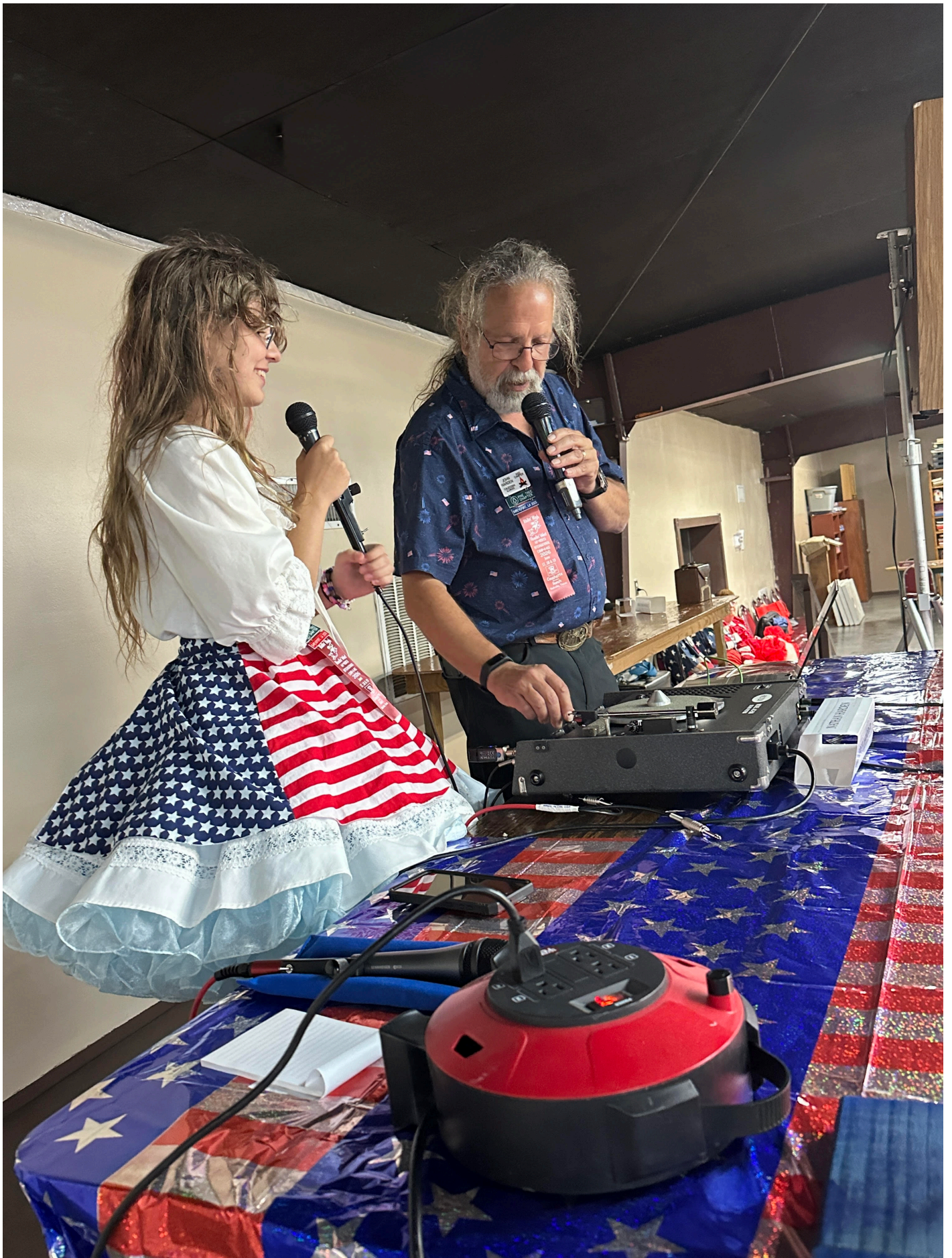
Looking forward to sending some more photos from tonight's dance.